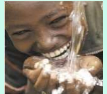
Drinking Water Supply