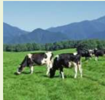
Livestock Water Supply